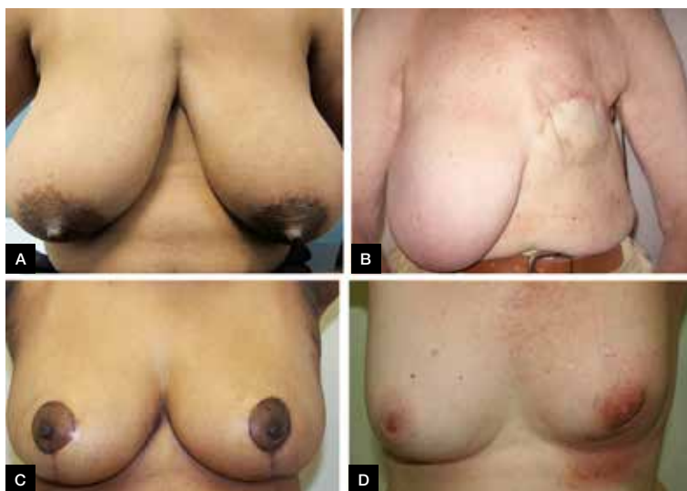
Figure 1. Breast surgical procedures

A. Original intact breasts of a patient with large breasts pre-operation; B. Woman with large breasts following a mastectomy; C. Patient from Figure 1A post-bilateral breast reduction mammoplasty; D. Skin erythema following five weeks of radiation therapy to the left breast and one week boost using electron beam